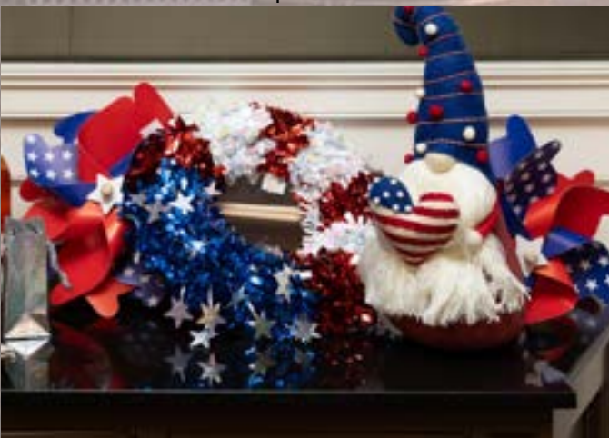
Fun Door Prize!