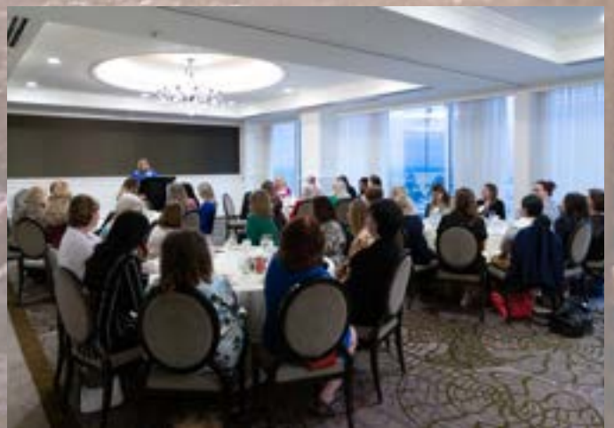
Monthly Meeting at The Petroleum Club