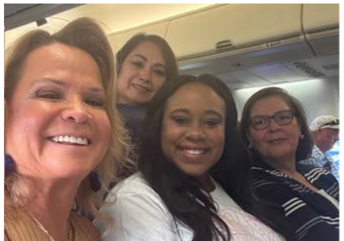
Even the skies are fun when this group gets together!