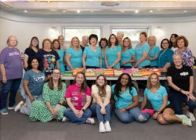
Showing off our pillowcases!