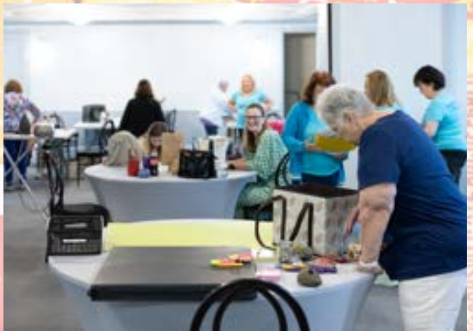
Everyone has a job!