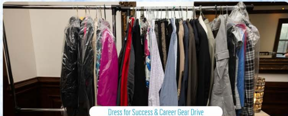
Dress for Success & Career Gear Drive