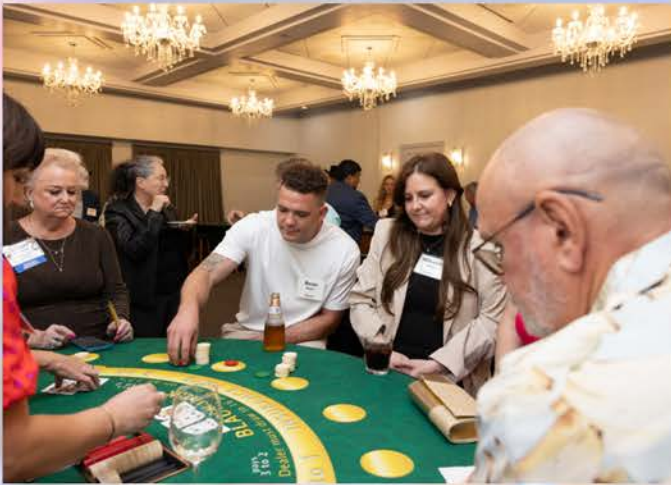
EWI Houston Casino Night!