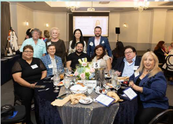
Douglas Elliman Real Estate Table