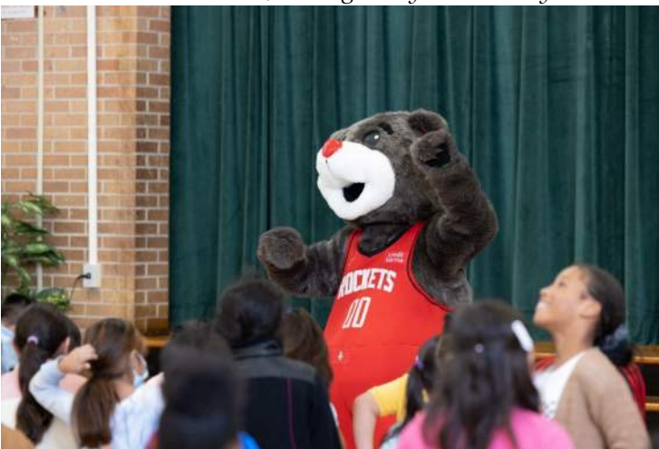
Clutch, representing Houston Rockets Second Graders, Montgomery Elementary