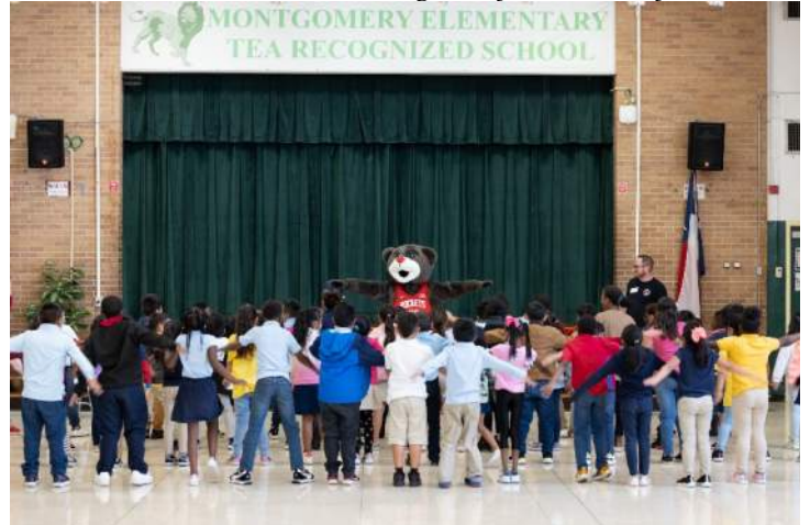
Clutch, representing Houston Rockets Second Graders, Montgomery Elementary