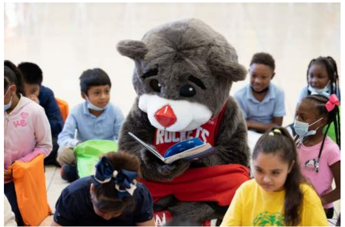
Clutch, representing Houston Rockets Second Graders, Montgomery Elementary