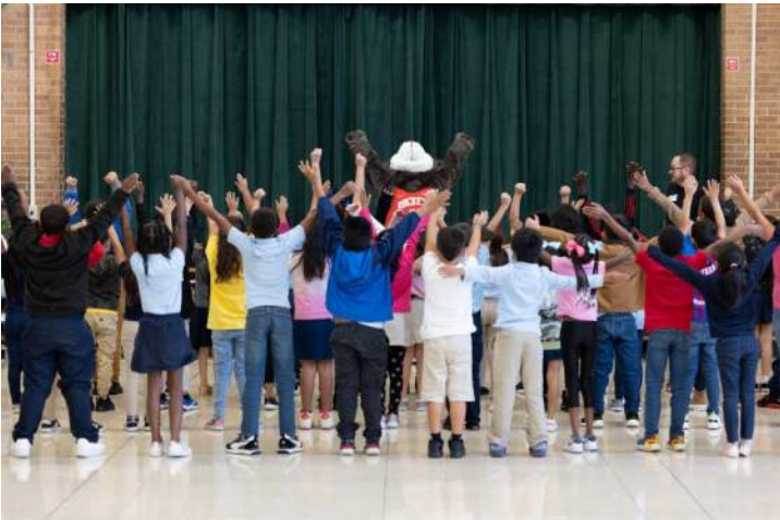
Clutch, representing Houston Rockets Second Graders, Montgomery Elementary