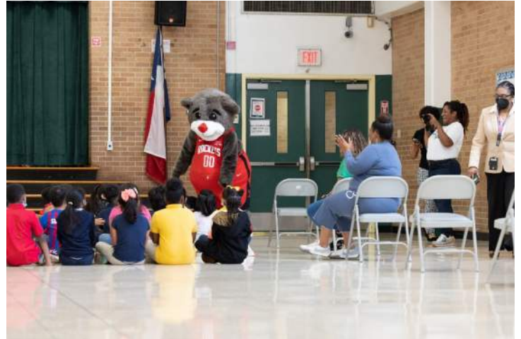
Clutch, representing Houston Rockets Second Graders, Montgomery Elementary