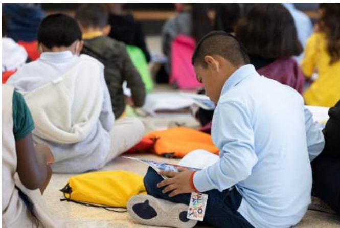
Second Graders, Montgomery Elementary