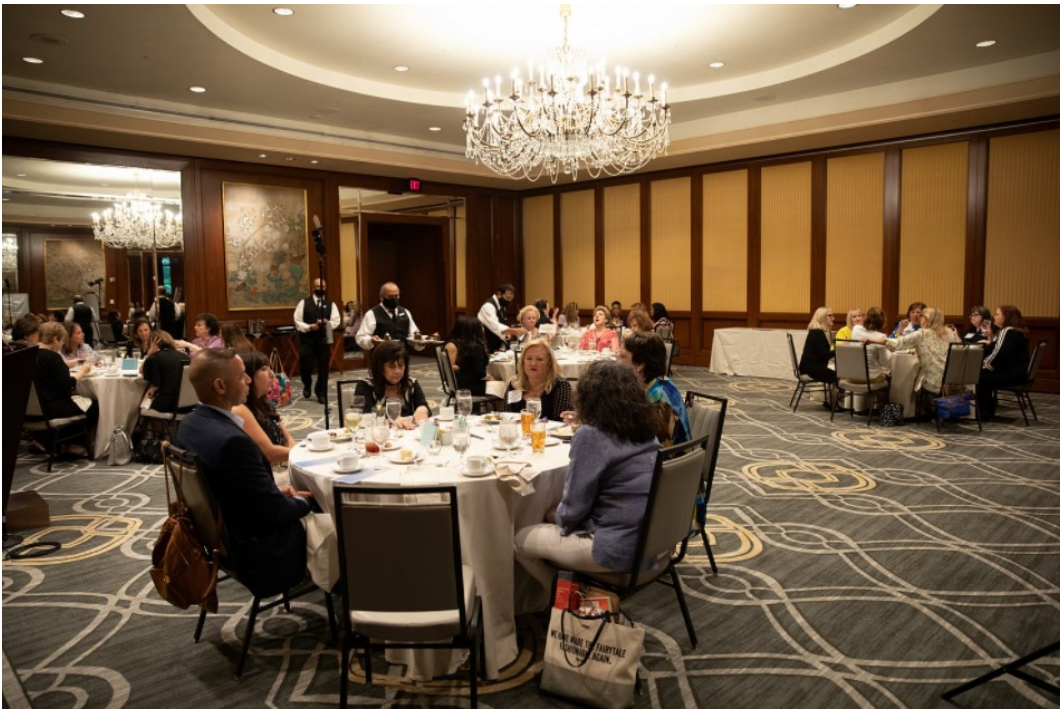
EWI of Houston June Monthly Meeting enjoying a delicious dinner and reconnecting with fellow members in one of the many beautiful spaces in the Omni Hotel Houston